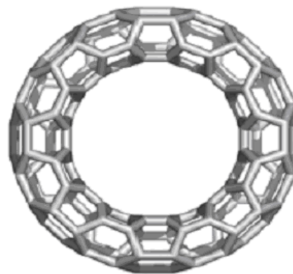
Fig. 1. An Achiral Polyhex Nanotorus.

is a graph automorphism of T and so if “ i is odd and r is even” or “ i is even and r is odd” then again u_{ij} and u_{rs} will be in the same orbit of Aut(T) , proving the lemma.